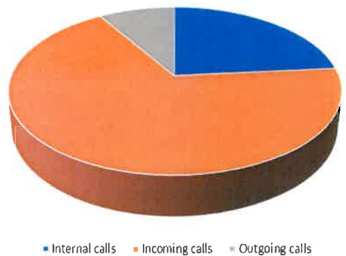
TOTAL CALLS 8996 - MARCH 2023