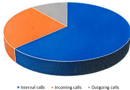
TOTAL CALLS 8980 - MARCH 2023