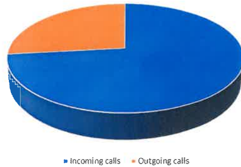
TOTAL CALLS 2400 - MARCH 2023