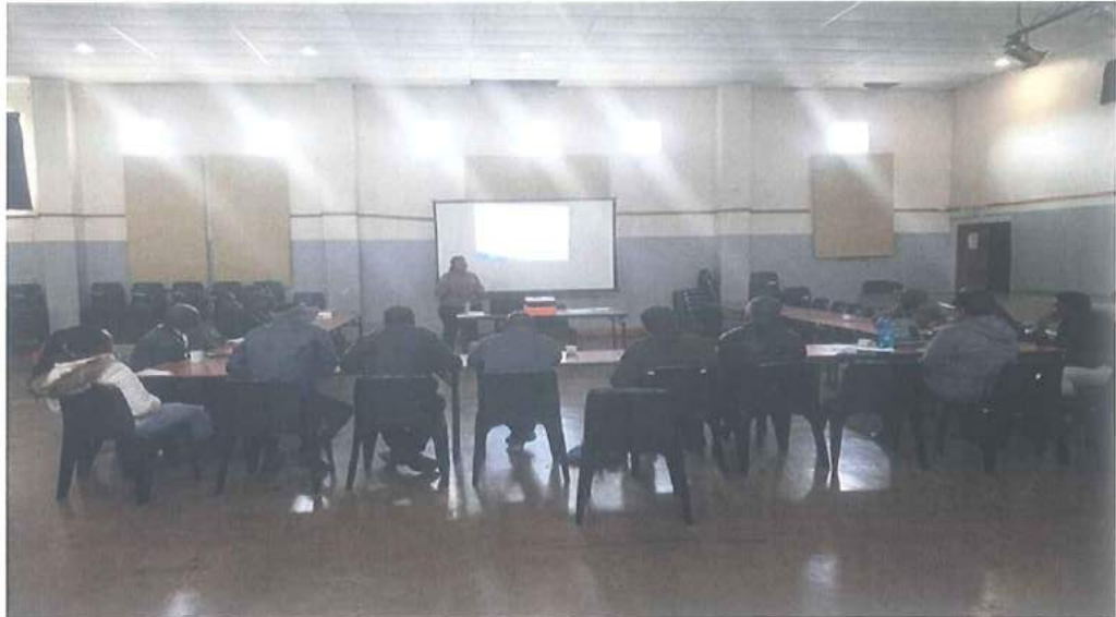
Image 3: Financial Management Workshop participants at (Moffat Hall)