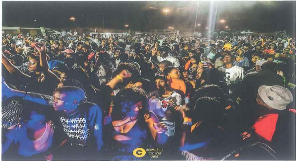
Image 1: Ubumnandi Festival (16.12.2018; Zwelihle Sports Ground)