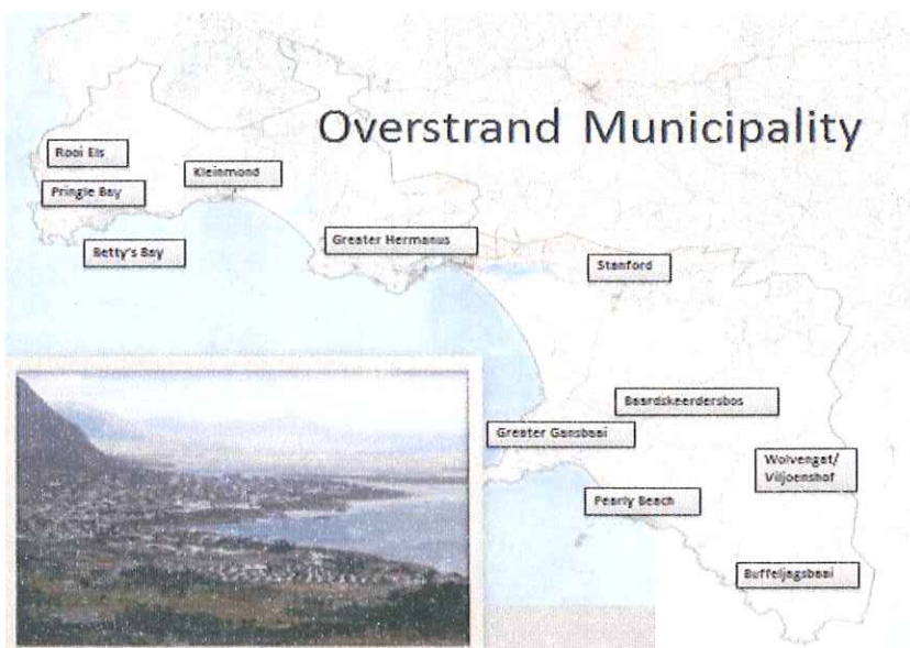
Map: Overstrand Municipality

The IDP will be applicable to the Overstrand Municipal Area which comprises a geographical area approximately 1708 km 2 , with a population of 93 466 people (2016 Community Survey) and covers the areas of Hangklip/Kleinmond, Greater Hermanus, Stanford and Greater Gansbaai. The municipal area has a coastline of approximately 230 km, stretching from Rooi Els in the west to Quinn Point in the east.