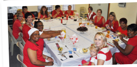
Ulawulo lwase Gansbaai