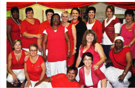
Ulawulo lwase Gansbaai

Umntu ofuna ukuthandana nomnye angalisebenzisa eli thuba lokuvakalisa oko. USuku lukaValentine lusuku lomntu wonke othanda omnye nothandwayo kwaye abantu bavakalisa uvakalelo lwabo nabahlobo babo, neentsapho zabo okanye nezithandwa zabo. Abantu abaninzi bacinga ukuba ukuthandwa kuthetha ukuba ube kubudlelwano bothando kanti oku kuthetha ukuba uhlale yonke imihla unobungangamsha. Yonke into oyenzayo noyithethayo ibonisa ihlabathi lonke ukuba ungubani kanye kanye. "Ulonwabo onalo lulingana nothando olunika abanye abantu". Buka iifoto ezithathwe ngabanye boogxa bethu abalubhiyozele ngokufanelekileyo olu suku. Mhlawumbi ziya kukukhuthaza wenzele umntu omthandayo into efana yodwa kwixa elizayo.