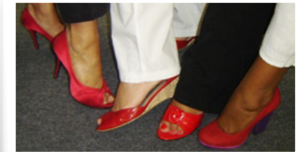
Iqela laseHermanus kundlunkulu