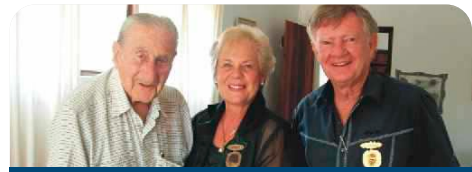
UMAMKELI WEENDWENDWE ONOBUBELE KWA-102

Wonk' ubani wase-Overstrand uyaminywa uku- ba azimase esi siganeko simnandi sizukileyo nesinemfundiso. Abantu baza kuthathi 'inxaxheba simahla yayo yonke imisebenzi. Khangela iindaba okanye utyelele kwijelo le-OCF elileli ( www.ocf.co.za ) ukuze afumane iinkcukacha.