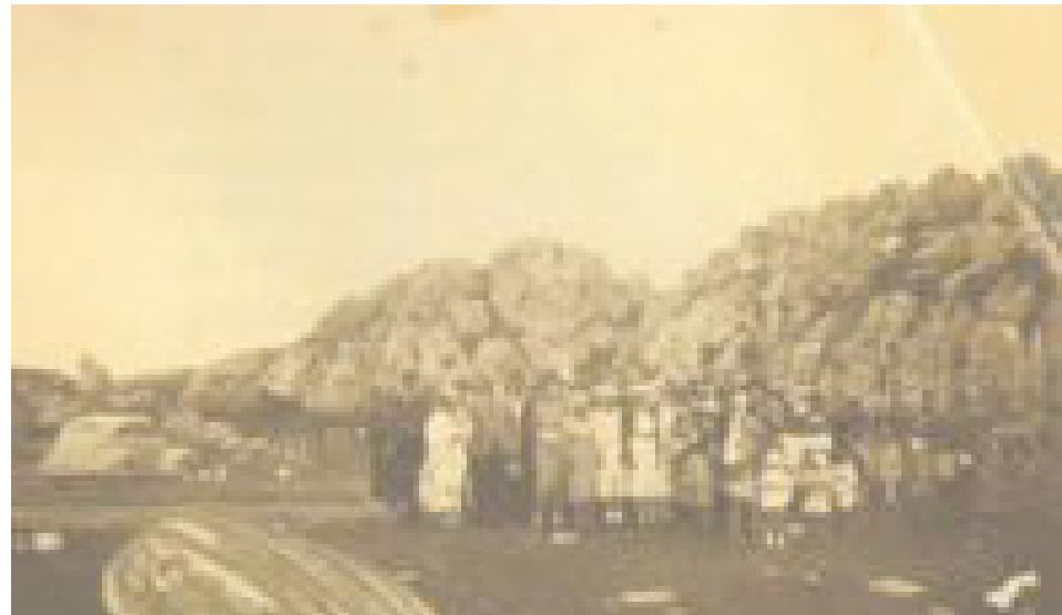
Jongensklip, Kleinmond (no reference)

The Zwelihle informal settlement was established just outside Kleinmond in the 1990s. The Walsch brothers owned virtually the entire strip of coast from Rooiels to the Palmiet River at the end of the 19th century/ early 20th century.