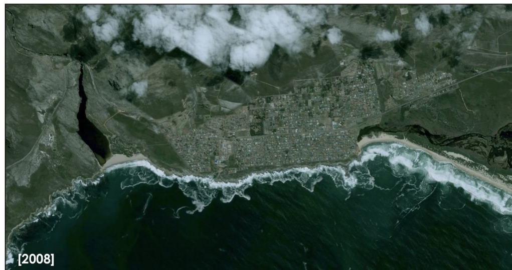
Evolution of place: Kleinmond