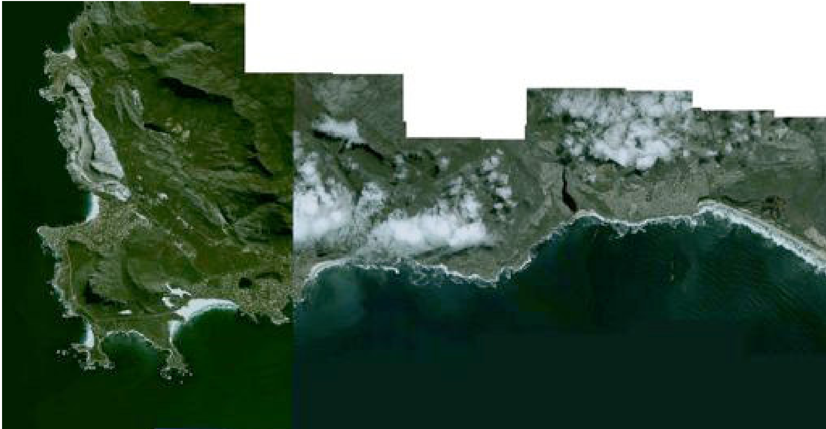
Aerial photography: Rooiels to Kleinmond