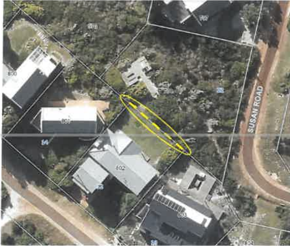
Figure 1: Shared boundary

Erf 798 is situated at 22 Susan Road and Erf 802 is situated at 12 Valsbaai Road. The owners recently bought the two properties which was also jointly owned by the previous owners, and which share a common boundary of ±20m. They now wish to consolidate the two properties.