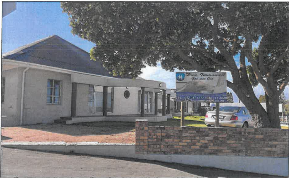
Photo 1. Erf 78 in a south-eastern direction from the corner of Church and Voortrekker Street.

Erf 78 is registered under title deed T17154/2021.