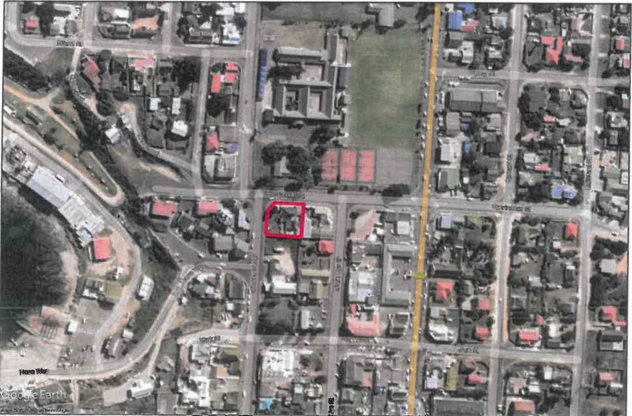
Google Earth Image, to illustrate the location of Erf 78 and surrounding land use.

Properties surrounding Erf 78 are of a mixed use, with only a few residential properties remaining. The property north of Erf 78 is a school, towards the east is a business premises that is currently not in use. Towards the south is a vacant business premises and west of the property is a residential building.