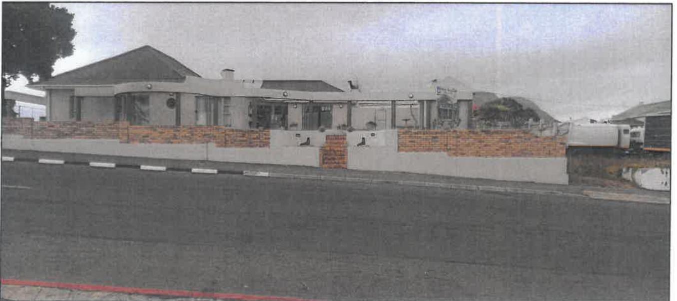
Photo 2. Photo taken from Church Street, towards front of house