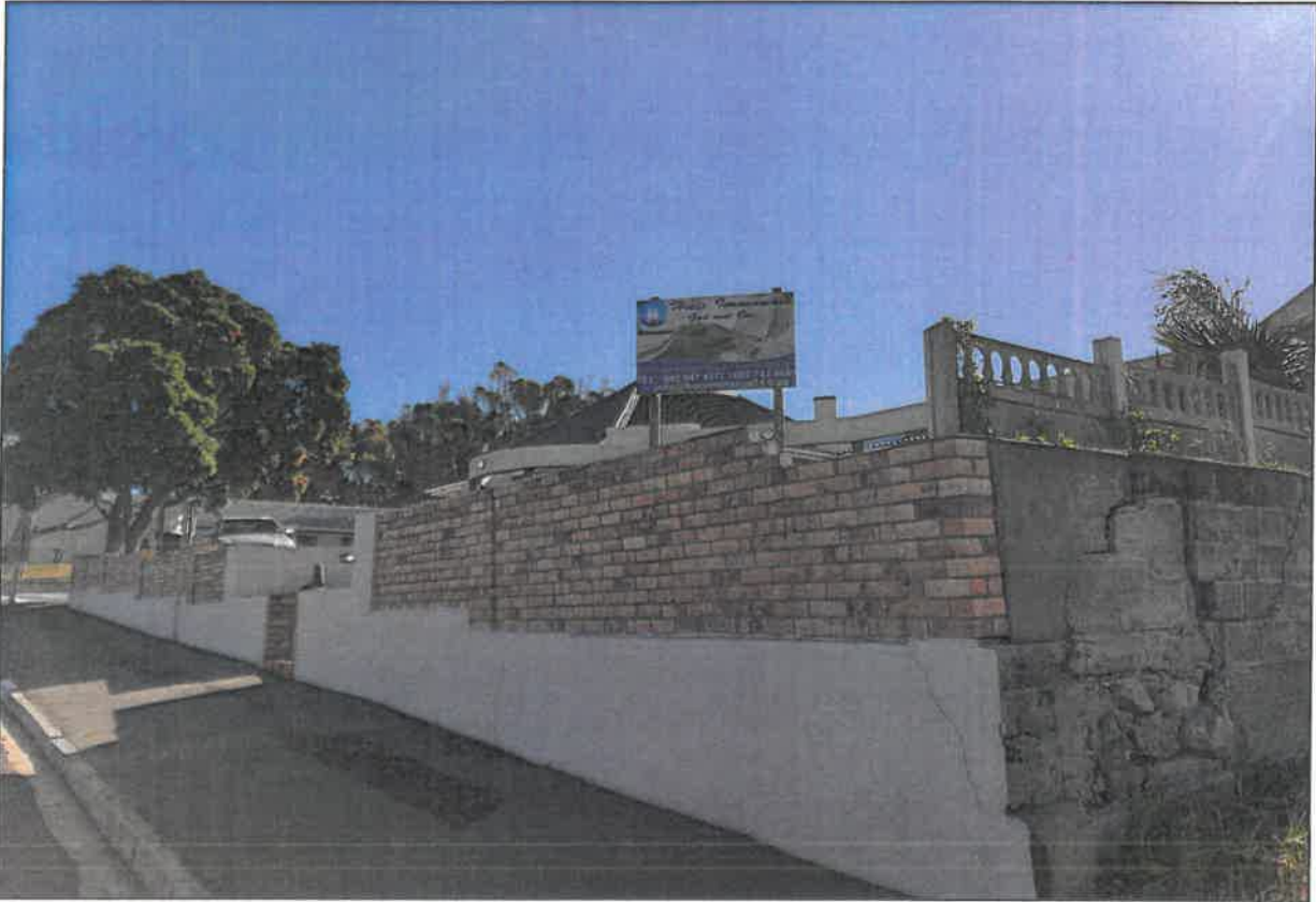
Photo 1. Corner of property on Church Street

The slope along Church Street is steep and access from here is not viable for the client