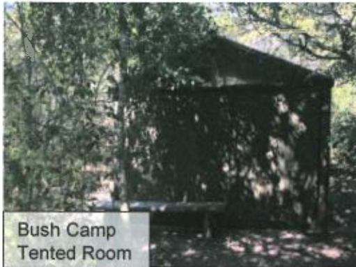
Bush Camp Tented Room

Please refer to the photographs below depicting the Forest Camp.