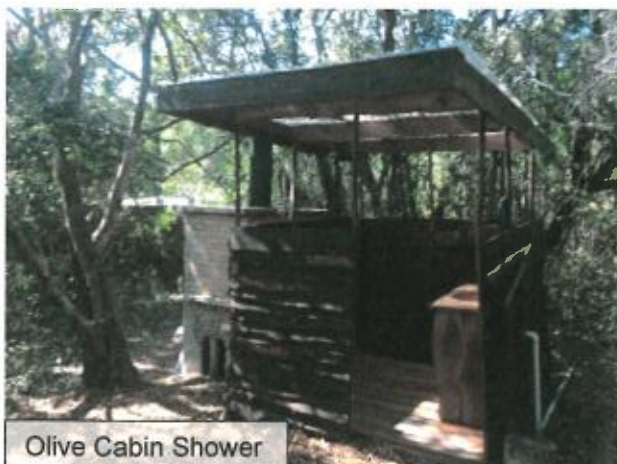
Olive Cabin Shower