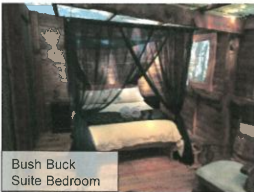
Bush Buck Suite Bedroom