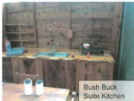
Bush Buck Suite Kitchen