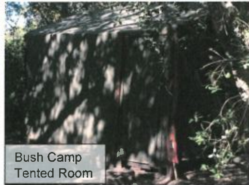
Bush Camp Tented Room