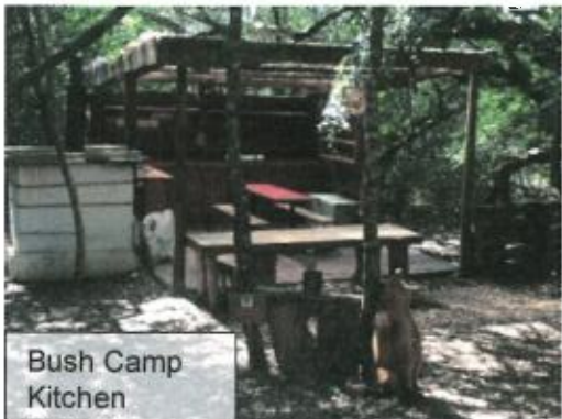
Bush Camp Kitchen