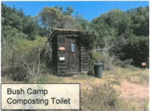
Bush Camp Composting Toilet