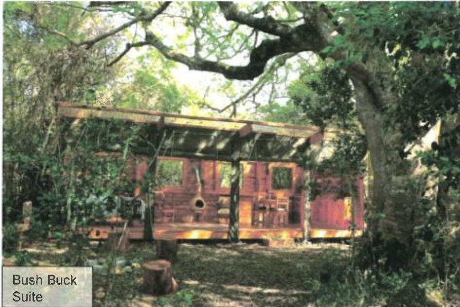
Bush Buck Suite