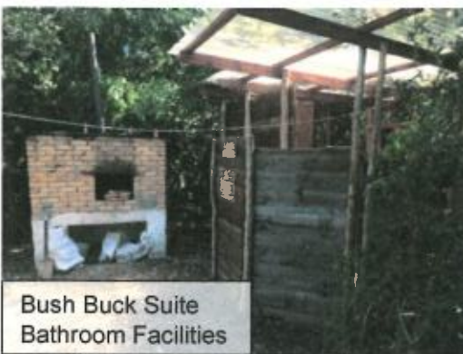
Bush Buck Suite Bathroom Facilities