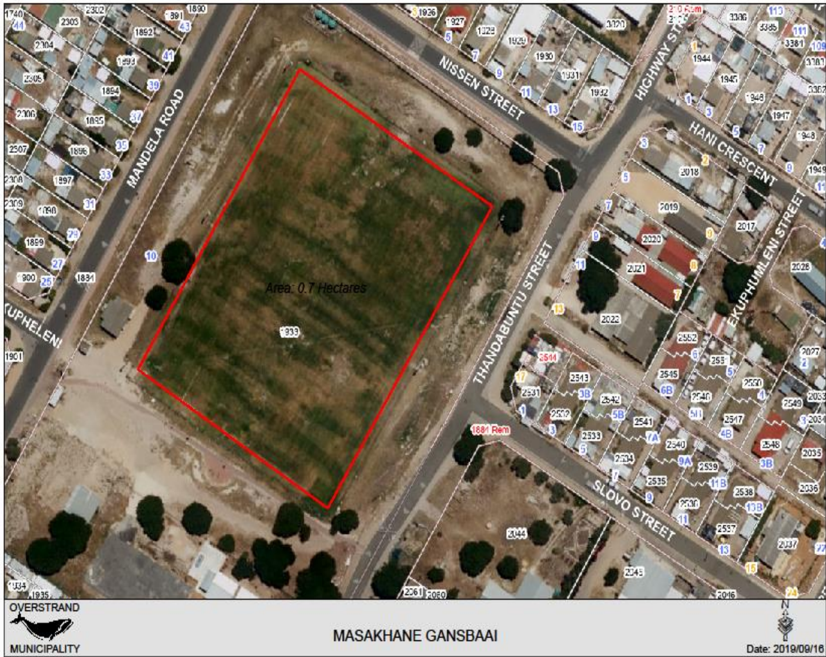
DIAGRAM G – MASAKHANE