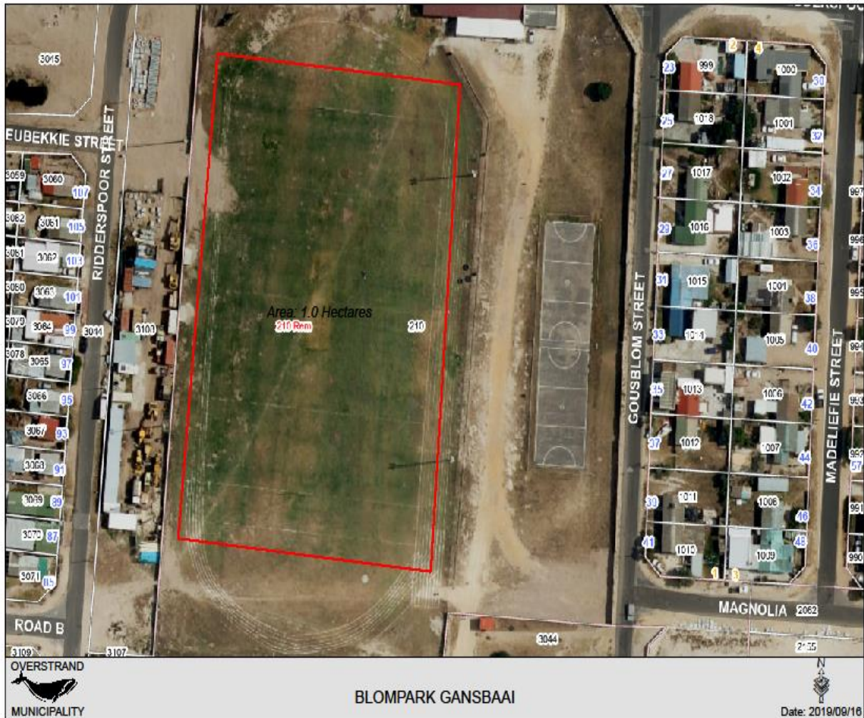
DIAGRAM I – BLOMPARK