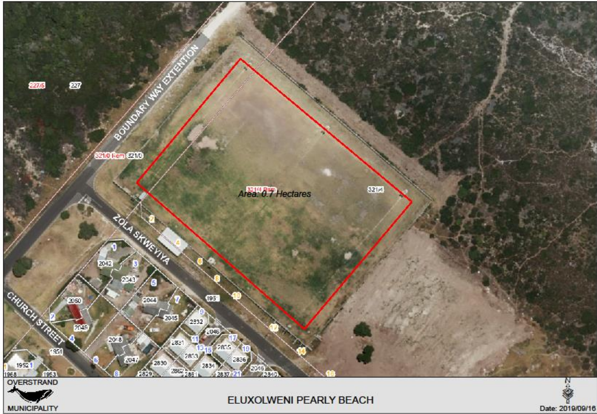
DIAGRAM J – ELUXOLWENI