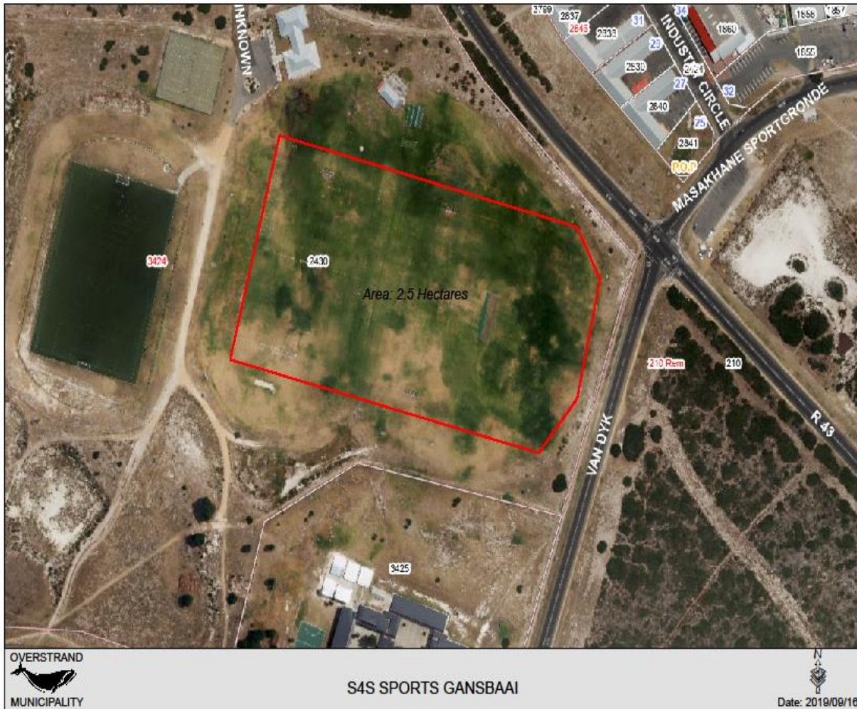
DIAGRAM H – SPACES 4 SPORTS