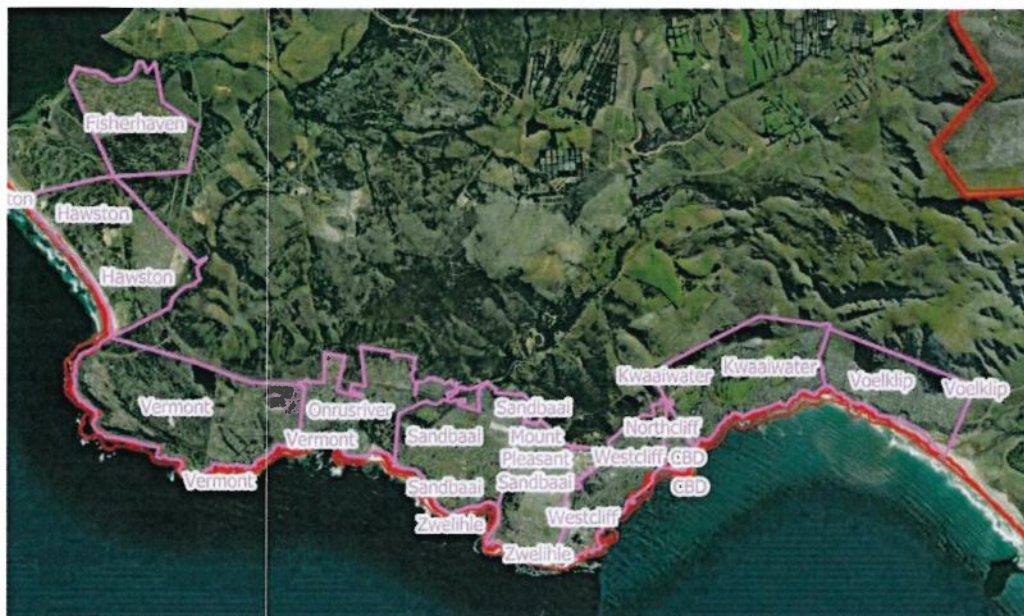
Figure 4: Overview of Greater Hermanus