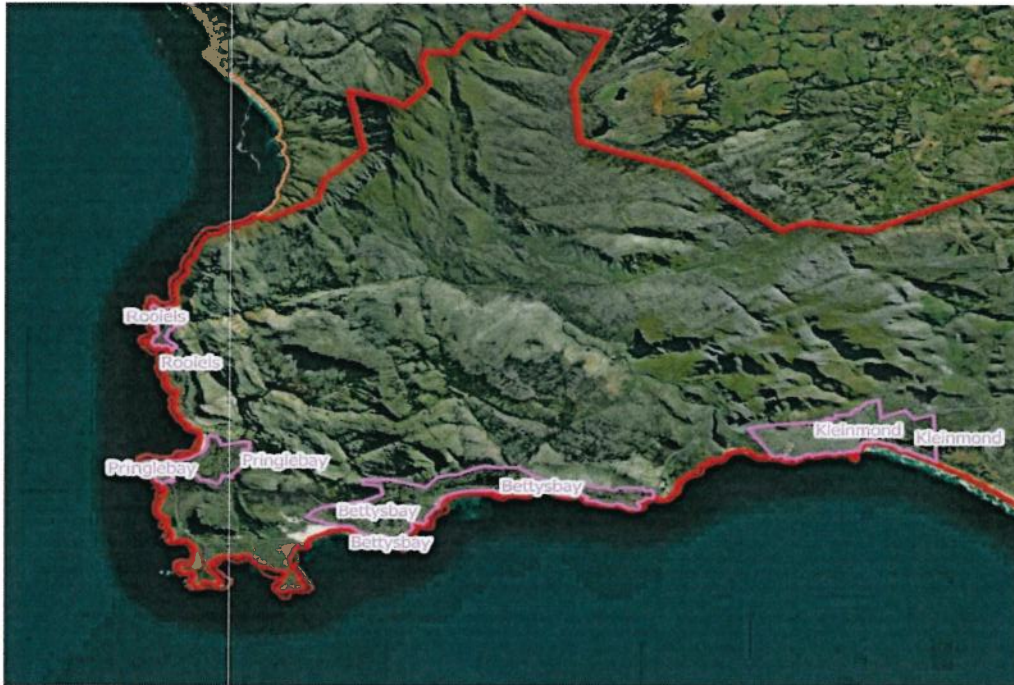
Figure 3: Overview of Hangklip/Kleinmond

Refer to Overstrand Municipality Fire Season Plan for more details on the description of high risk areas.