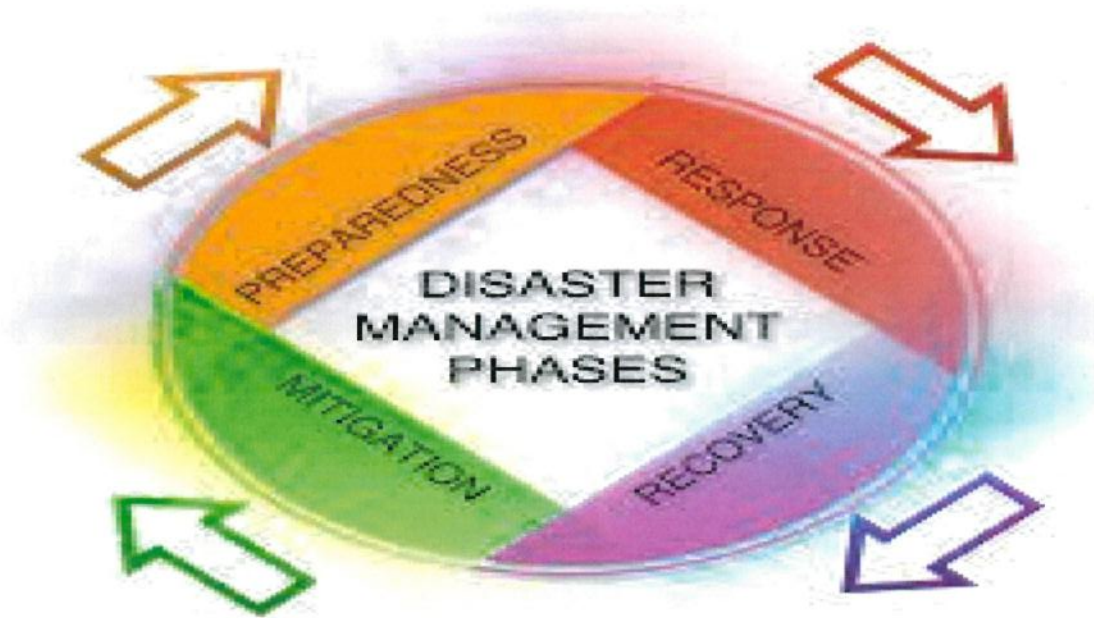
Figure 1: Disaster Management phases

The approach to disasters and disaster management in South Africa has changed and are aligned with international trends. This was accomplished by adopting measures to reduce or prevent the risk of disaster by integrating risk reduction strategies into future development projects or plans (closing the gap between development and disasters) to create resilient communities rather than dealing with disasters once it occurs.