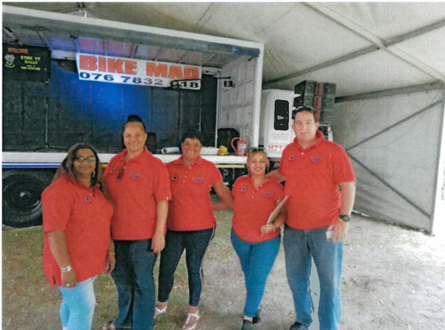
Figure 9: Disaster Management Team