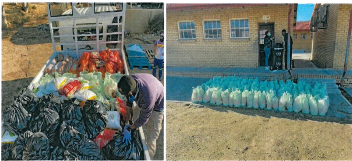
Figure 7: Distribution of food parcels (Left: Siya Kolisi Foundation and Right: Brian Habana Foundation)