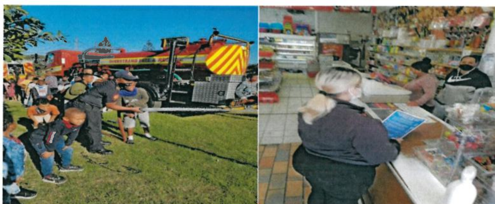
Figure 8: Covid-19 awareness campaigns

Other initiatives of the Disaster Management Team include the distribution of sanitation (soap) and hygiene products (hand sanitizer) to vulnerable communities, loud hailing in communities most at risk (in conjunction with the Ward Councillor and Office of the Area Manager) and various PIER (Public Information & Education Relations) at creches, schools, local businesses and old age homes.