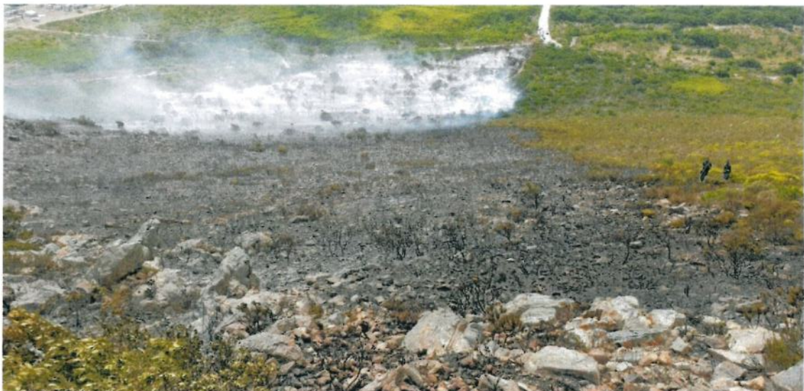
Figure 6: Masakhane fire burn scar