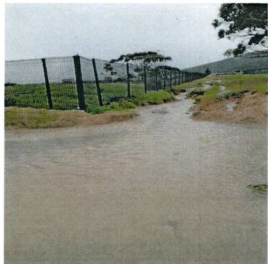
Figure 2: Hawston floods