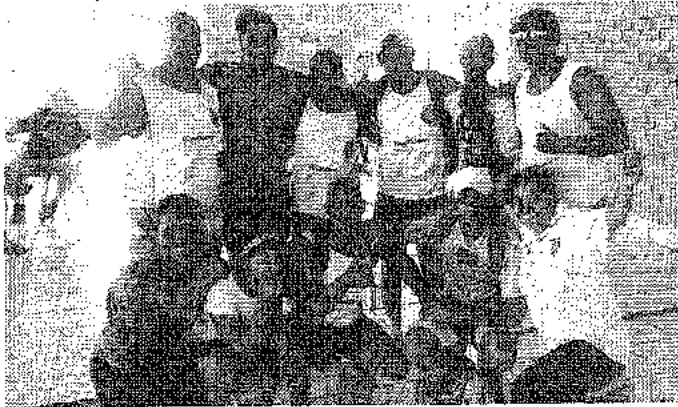
Die Black Leaves Boys lyk hier heel in hul skik met hulle oorwinning vir die dag, nadat hulle in 'n naelbytstryd in die finaal met die Young Maori's afgereken het.