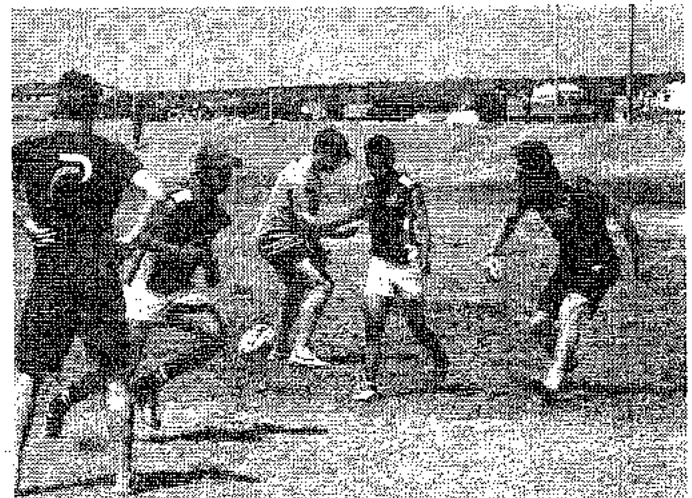
Die spelers in aksie tydens die Touchies Toernooi.

Municipal Notice No. 152/2017 Municipal Notice No. 153/2017