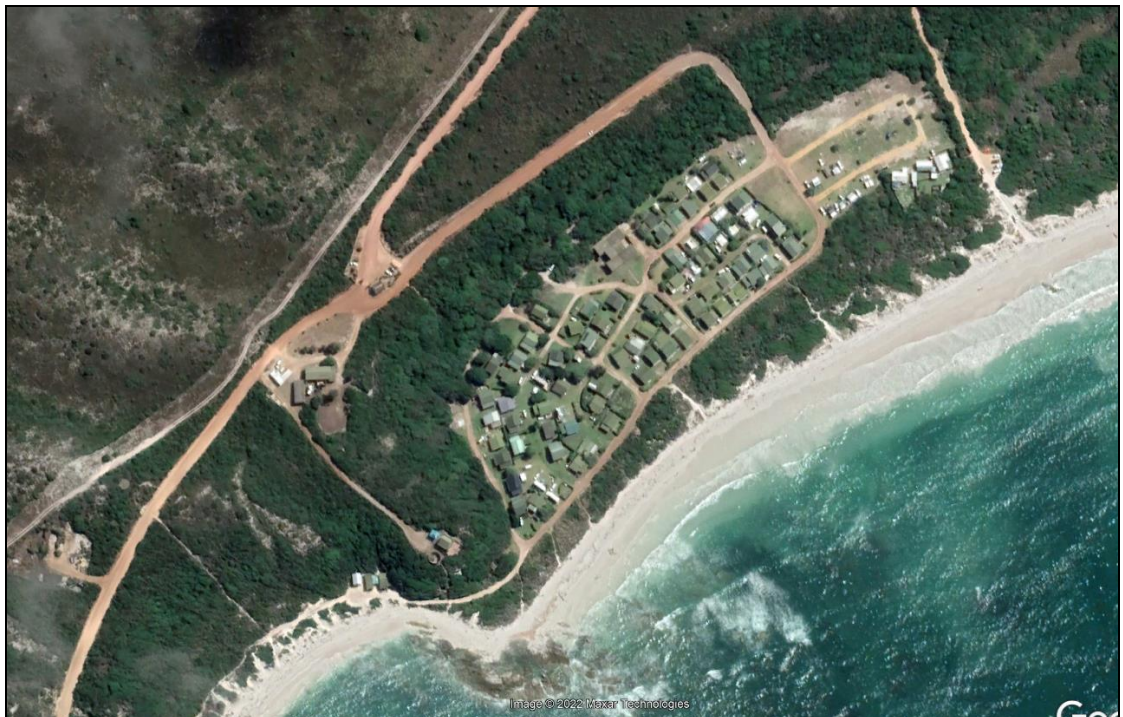
Figure 13: Google Earth imagery dated 6 February 2021 of Die Dam Holiday Resort (east wing)