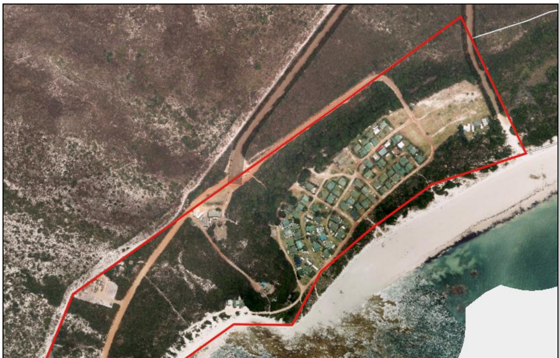
Figure 11: Overstrand Municipality GIS 2020 imagery of Die Dam Holiday Resort (east wing)