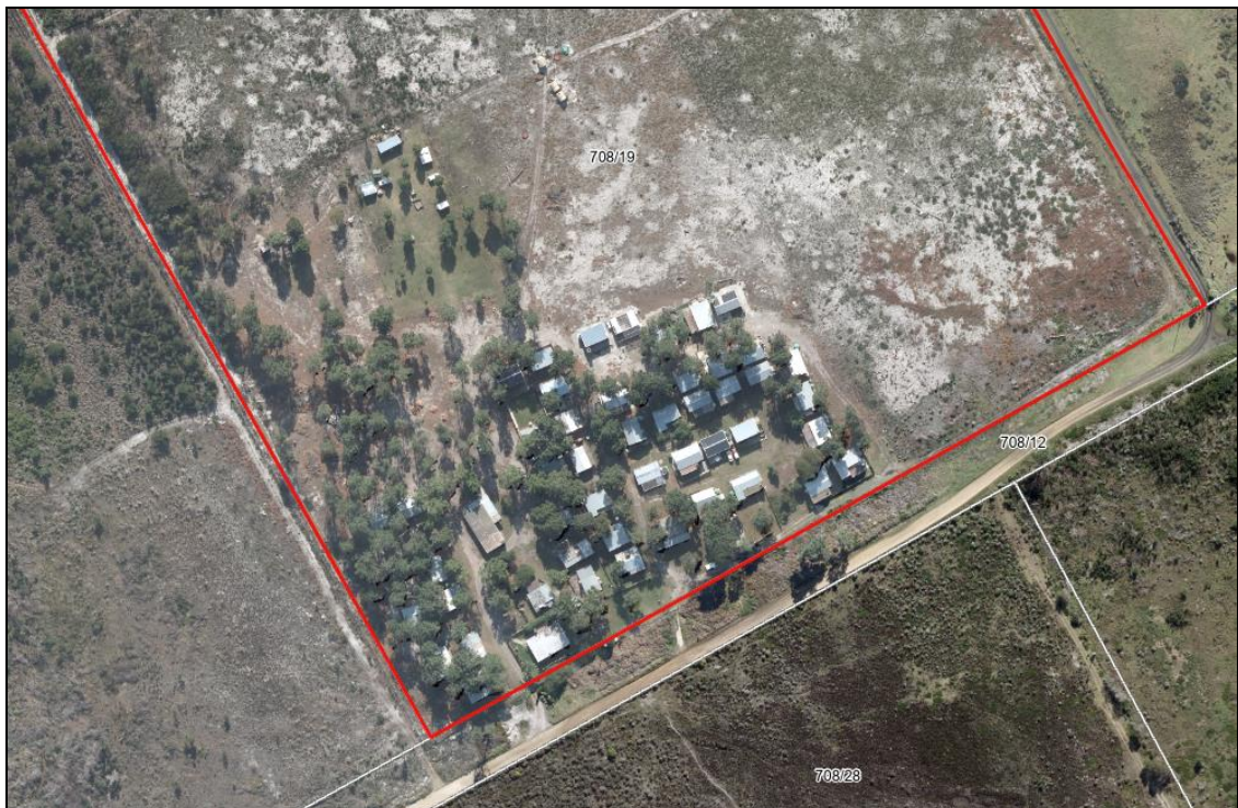
Figure 5: Overstrand Municipality GIS 2020 imagery of Pierre Jeanne Gerber Private Nature Reserve

A notice of non-compliance has already been served onto the property owner to cease the unauthorised land uses and to rectify the matter. The case is being monitored and further action will be taken as required in terms of the Overstrand Municipality Amendment By-Law on Municipal Land Use Planning, 2020.