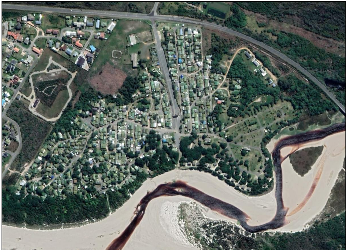
Figure 8: Google Earth imagery dated 22 September 2021 of Uilenkraalsmond Resort