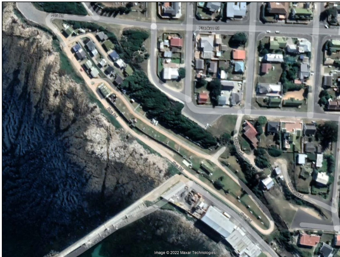
Figure 2: Google Earth imagery dated 17 April 2021 of Gansbaai Caravan Park