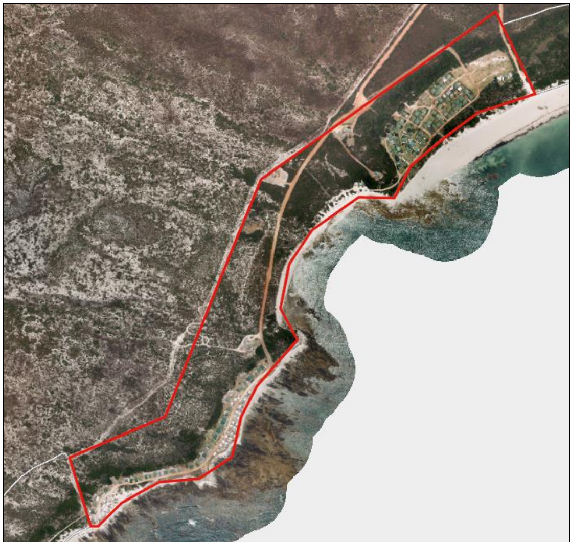
Figure 9: Overstrand Municipality GIS 2020 imagery of Die Dam Public Holiday Resort

Correspondence with the Overberg District Municipality will recommence, and the required steps taken to address the unauthorised land use of the property.