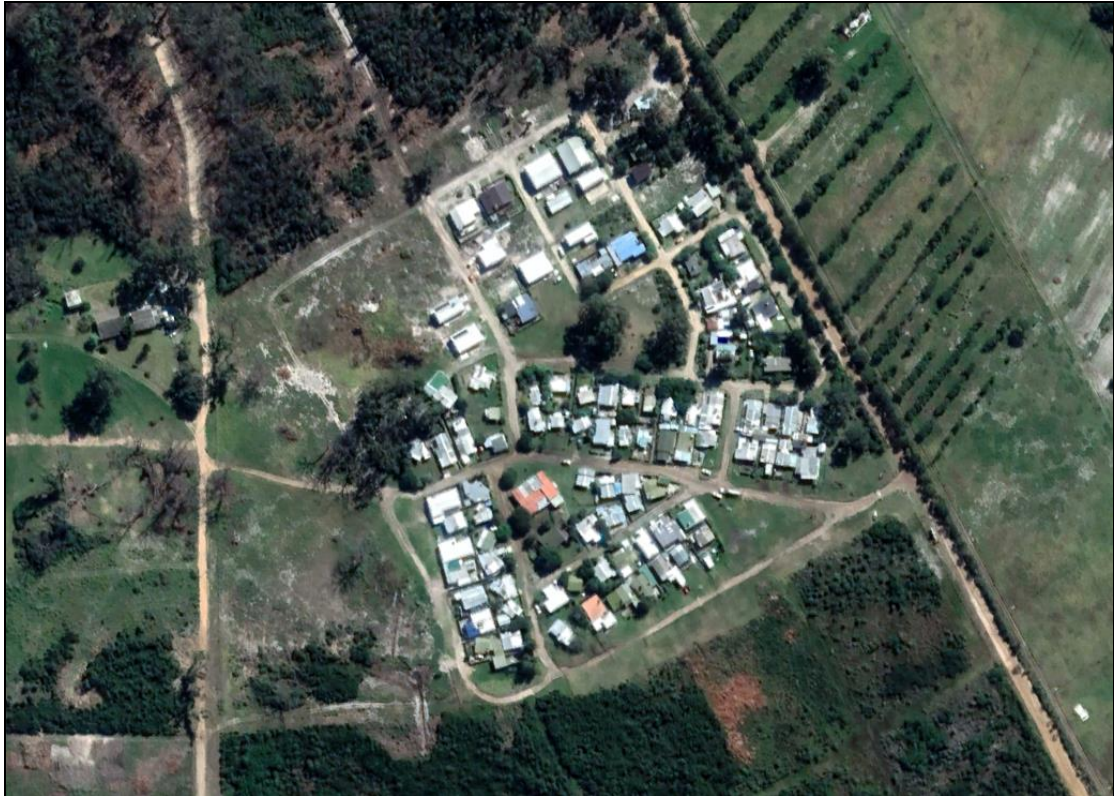
Figure 4: Google Earth imagery dated 22 September 2021 of Franskraal Caravan Park