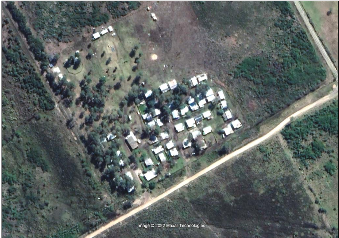
Figure 6: Google Earth imagery dated 22 September 2021 of Pierre Jeanne Gerber Private Nature Reserve