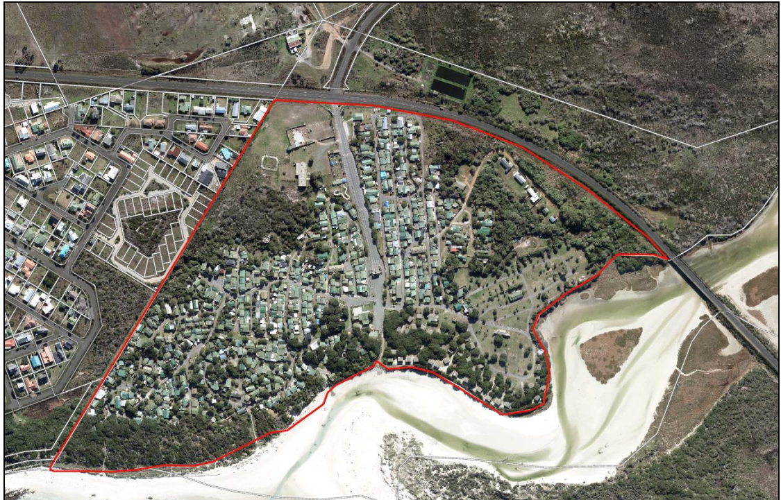
Figure 7: Overstrand Municipality GIS 2020 imagery of Uilenkraalsmond Resort