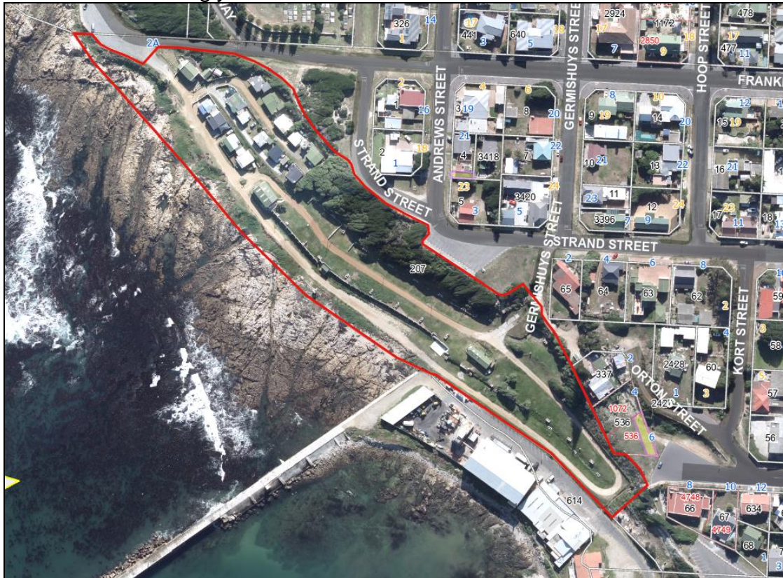
Figure 1: Overstrand Municipality GIS 2020 imagery of Gansbaai Caravan Park

The land use of the property is not as per the Resort Zone of the property as the 14 semi-permanent structures are not available to the general public and 7 of the 14 structures are being occupied on a permanent basis. The matter will be discussed with the relevant municipal departments and addressed accordingly.