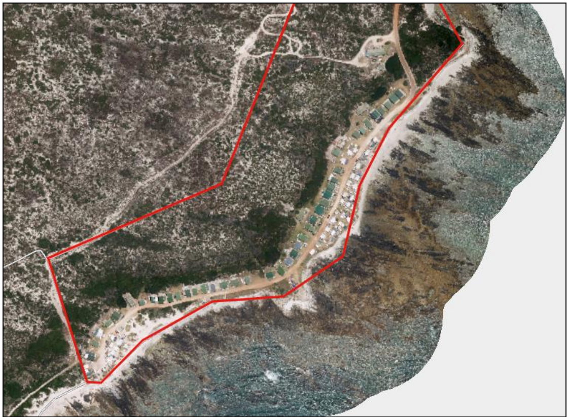
Figure 10: Overstrand Municipality GIS 2020 imagery of Die Dam Holiday Resort (west wing)