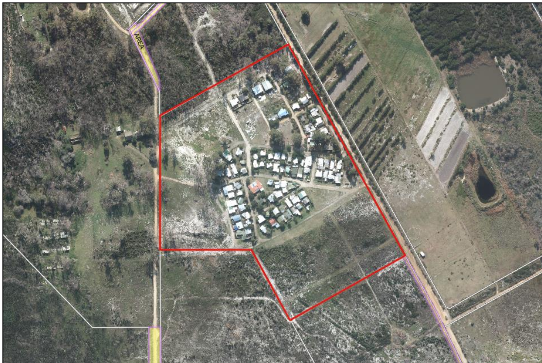
Figure 3: Overstrand Municipality GIS 2020 imagery of Franskraal Caravan Park

The process to take action in terms of the Municipality Amendment By-Law on Municipal Land Use Planning, 2020 is already in motion. A notice of non-compliance will be served onto the property owner in due course providing instruction to cease the unauthorised land uses and to rectify the matter.